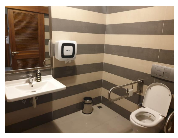
There are disabled toilets in public areas for the use of disabled guests.