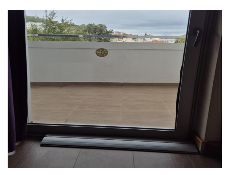
We have rooms suitable for guests with disabilities.