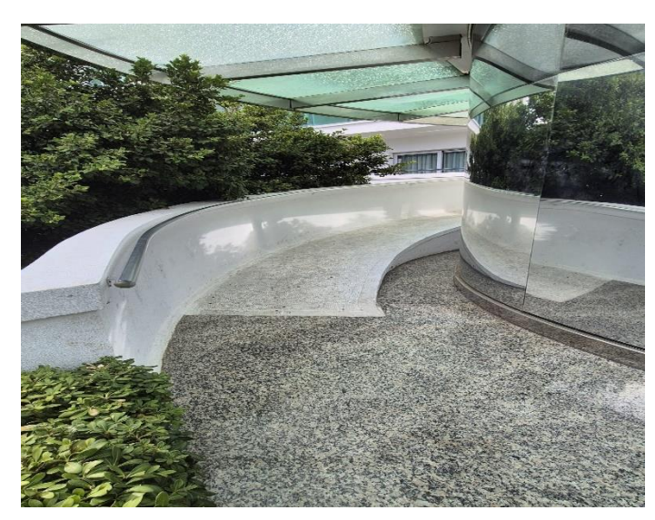
The entrance of the hotel is equipped with a ramp.