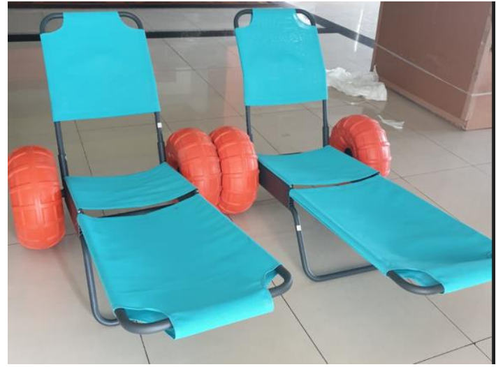
Our hotel provides a pool lift and beach wheelchair for guests with disabilities.